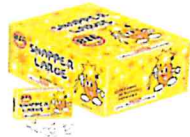
Snappers/ Drop Pops