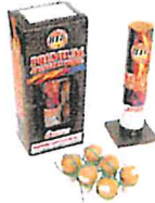
Reloadable Shell Device