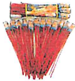
Bottle Rockets/ Sky Rockets